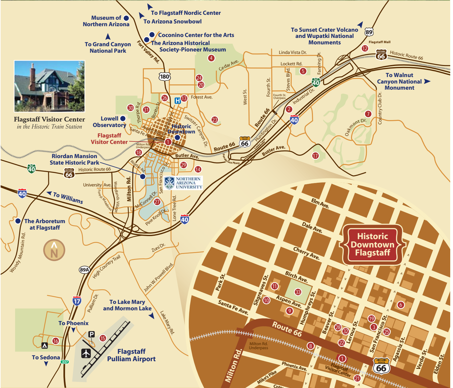
Flagstaff Visitor Center in the Historic Train Station